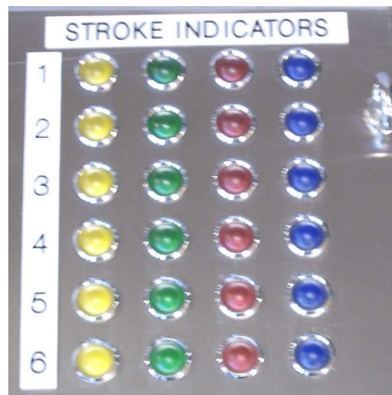
Stroke indicator panel on the console.